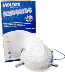
Nuisance Dust Masks