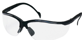
Venture II Glasses