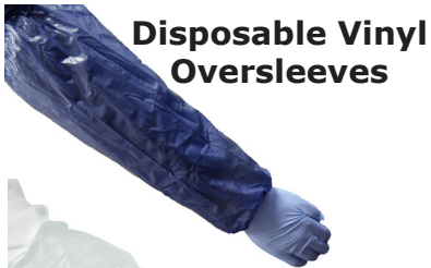
Disposable Vinyl Oversleeves