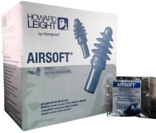
Howard Leight Airsoft