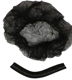
Disposable Mob Caps - Black, Blue