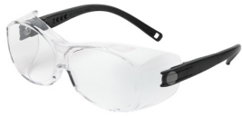
OTS Safety Glasses

Available Lens Colors: Clear, Smoked, Blue