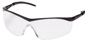
Mayan Safety Glasses