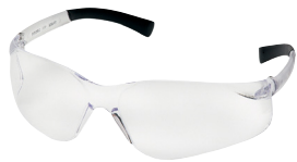
Ztek Safety Glasses