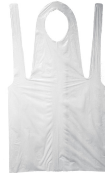
Disposable Polyethylene Aprons