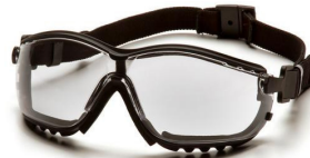
V2G Safety Goggles