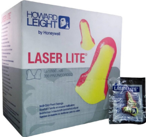
Laser Lite Ear Plugs