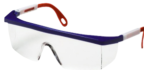
Integra Safety Glasses