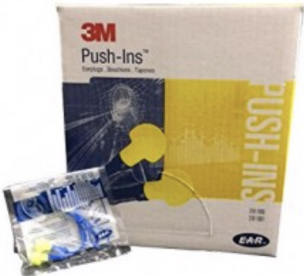
Push - Ins