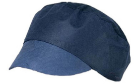
Disposable Blue Peaked Caps