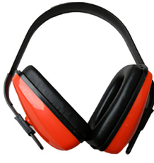
Adjustable Earmuff - 25 NRR