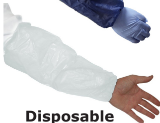
Disposable Polyethylene Oversleeves