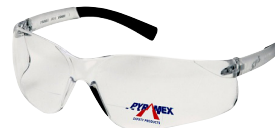
Ztek Reader Glasses