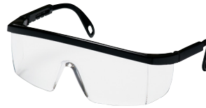
Black Trim Glasses ANSI & CE

Available Lens Colors: Clear, Smoked, Blue