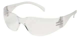
Wrap - Around Glasses ANSI & CE

Available Lens Colors: Clear, Smoked, Blue