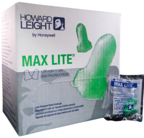
Max Lite Ear Plugs