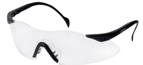
Intrepid Safety Glasses